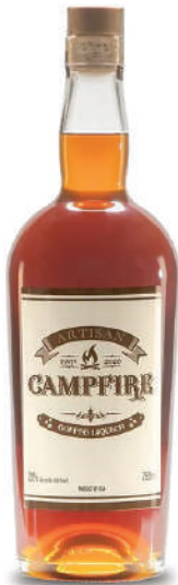
Coffee Liqueur 40 PR / 750ML 6 Case Pack