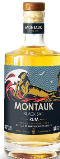
Black Sail Rum 80 PR / 750ML 6 Case Pack