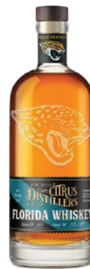
Jacksonville JAGS Whiskey 750ML 6 Case Pack