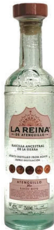
Blanco Ancestral 80 PR / 750ML 6 Case Pack