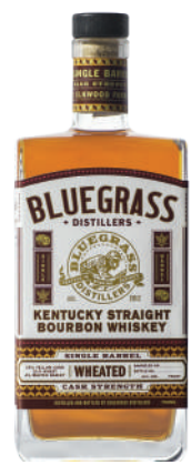
Straight Wheated SBB Cask Strength / 750ML 6 Case Pack