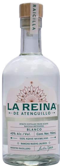
Blanco Artesanal 80 PR / 750ML 6 Case Pack

In this region regulations say only 10% of the regions agave can be harvested, so this happens when the rainy season is over and agaves are no longer bloated. Agave maximiliana only reproduce from the seeds of the quiote (stalk), this means it does not produce hijuelos (baby clones that sprout from the roots) like many other types of agave.