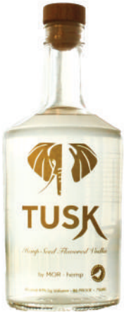
Hemp Seed Vodka 80 PR / 750ML 6 Case Pack

Founded by a active duty Military family, AS Legacy Vodka is a family project. A very clean Grape based Vodka.