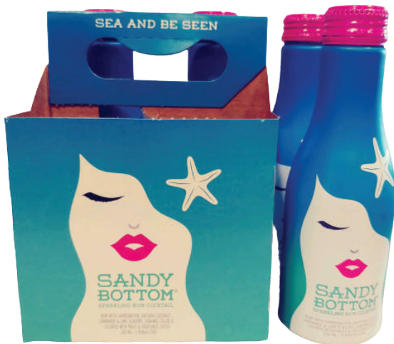
Sandy Bottom Sparkling Rum Cocktail 200ML 24 Case Pack

Sandy Bottom is a pre-mixed, rum-based sparkling cocktail with natural flavors of coconut, lemonade and lime. The pale pink shade is derived from fruit juices and is gluten free. It's a single serve-200 ml aluminum bottlecan, with resealable cap.