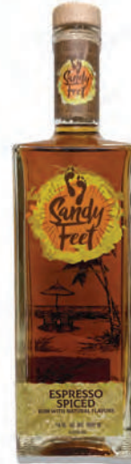
Espresso Spiced Rum 80 PR / 750ML 12 Case Pack