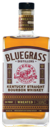
Straight Wheated 90 PR / 750ML 6 Case Pack