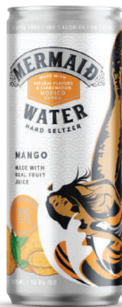
Black Cherry Seltzer 355ML 24 Case Pack