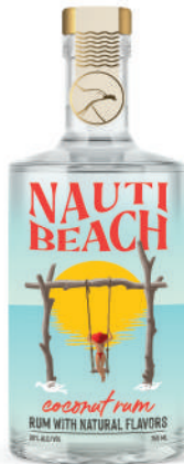
Nauti Coconut Rum 60 PR / 750ML 6 Case Pack