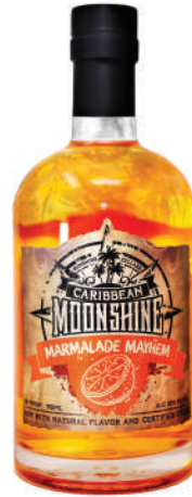
Marmalade Mayhem 50 PR / 750ML 12 Case Pack