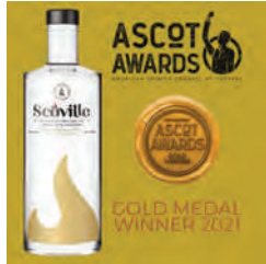
Scoville Jalapeno Vodka 80 PR / 750ML 12 Case Pack