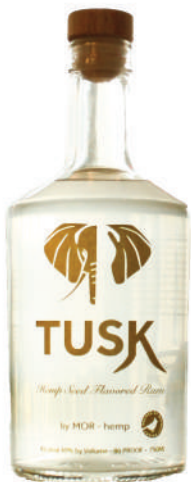
Hemp Seed Rum 80 PR / 750ML 6 Case Pack