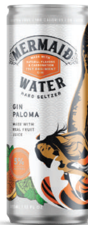
Gin Paloma Seltzer 355ML 24 Case Pack