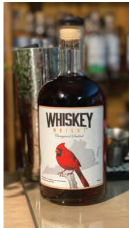
Whiskey Wright Cherry Wood Smoked 750ML 6 Case Pack