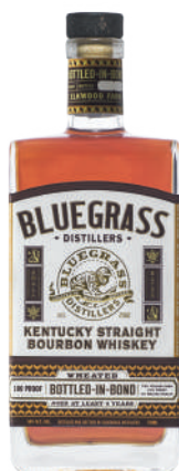
Straight Wheated BIB 100 PR / 750ML 6 Case Pack