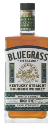
Straight High Rye SBB Cask Strength / 750ML 6 Case Pack