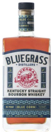
Straight Blue Corn 90 PR / 750ML 6 Case Pack

Bluegrass Distillers was first established in 2012 spending the next three years fine-tuning their mash bills and aging their bourbon to develop smooth, complex flavors. Known for Kentucky grown Blue Corn Bourbon, they are constantly expanding their product line that includes BIB offerings to Single Barrel and private label programs.