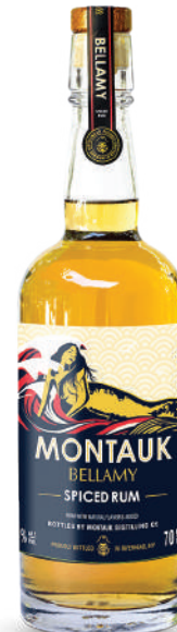
Bellamy Spiced Rum 70 PR / 750ML 6 Case Pack