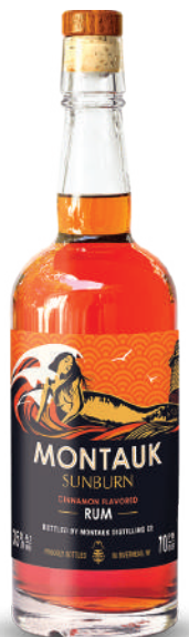
Sunburn Cinnamon Rum 70 PR / 750ML 6 Case Pack