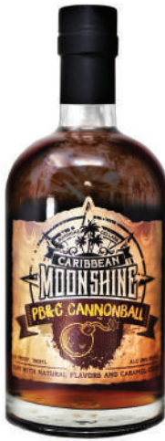
PB & Chocolate 50 PR / 750ML 12 Case Pack