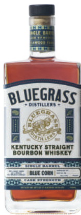
Straight Blue Corn SBB Cask Strength/750ML 6 Case Pack