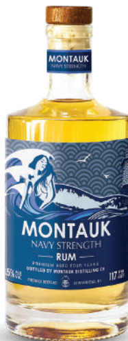
Navy Strength Rum 117 PR / 750ML 6 Case Pack