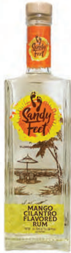
Mango Cilantro Rum 68 PR / 750ML 12 Case Pack