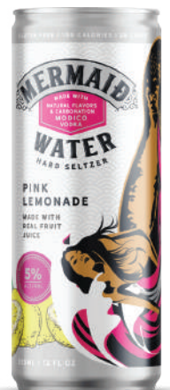
Pink Lemonade Seltzer 355ML 24 Case Pack