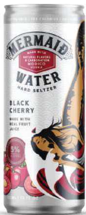
Mango Seltzer 355ML 24 Case Pack

After that, we infuse it with fruits and local botanicals to make the most pure and desirable tasting water on the market. How desirable? Just ask the mermaids.