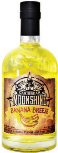
Banana Breeze 50 PR / 750ML 12 Case Pack