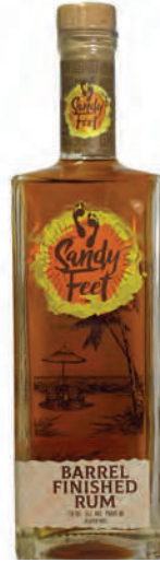
Barrel Finished Rum 80 PR / 750ML 12 Case Pack