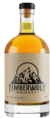
Timberwolf Whiskey 750ML 12 Case Pack