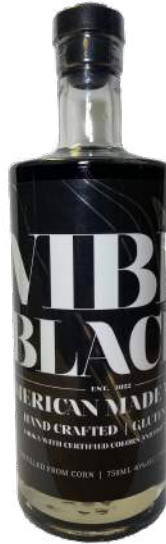
Vibe Black 80 PR / 750ML 12 Case Pack