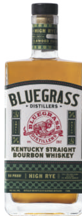
Straight High Rye 90 PR / 750ML 6 Case Pack