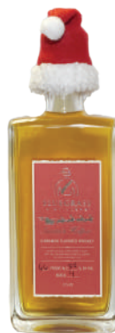
Santa's Helper Cinnamon Whiskey 66 PR / 750ML