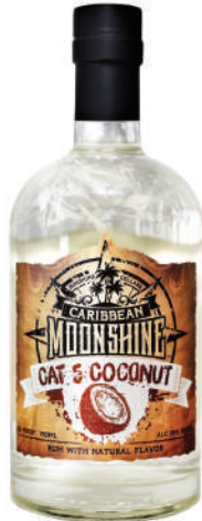
Cat 5 Coconut 50 PR / 750ML 12 Case Pack