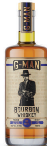
G-MAN Bourbon Whiskey 750ML 6 Case Pack