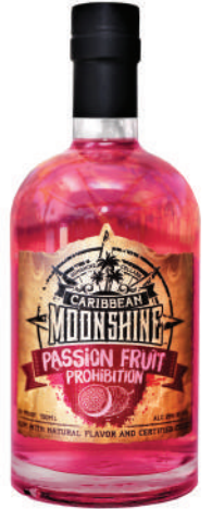
Passion Fruit 50 PR / 750ML 12 Case Pack